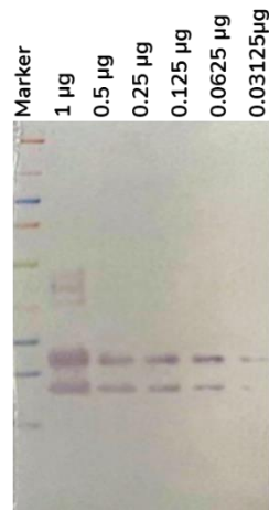
Figure 1: Western blot analysis of PtX™ Rabbit Anti-IFN-Gamma. Lanes 2 – 6: Varying amounts of antigen (IFN-Gamma) were run on the SDS-PAGE. Separated bands were transferred to the membrane and PtX™ Rabbit Anti-IFN-Gamma (1: 2 000) was used to detect the antigen. The two bands of IFN-Gamma were visualized following the addition of anti-rabbit secondary antibody with HRP and substrate. Our antibody was able to detect antigen amounts upwards of 30 ng (Lane 6).

Cape Biologix Technologies (Pty) Ltd. Address: Unit 3, The Powder Mill, 5 Sunrise Circle, Ndabeni, Cape Town, South Africa, 7405